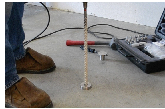
Figure 4. Using the Drilling Guide.

7) Screw the Secure Cover onto the Vapor Pin<sup>™</sup> and tighten using a #14 spanner wrench by rotating it clockwise (Figure 5). Rotate the cover counter clockwise to remove it for subsequent access.