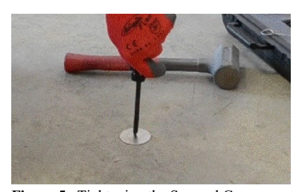
Figure 5. Tightening the Secured Cover.

7) Screw the Secure Cover onto the Vapor Pin<sup>™</sup> and tighten using a #14 spanner wrench by rotating it clockwise (Figure 5). Rotate the cover counter clockwise to remove it for subsequent access.