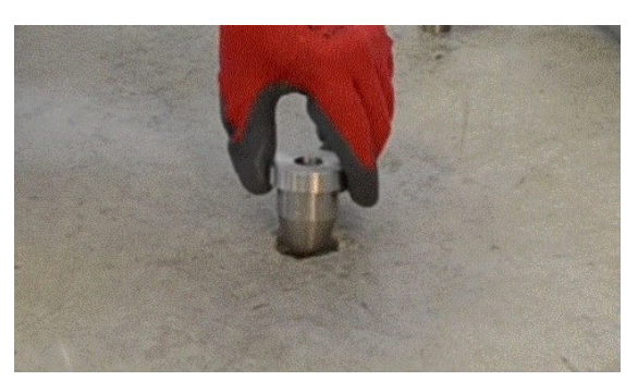
Figure 3 . Testing Depth with the Drilling Guide.

4) Remove cuttings from the hole and place the Drilling Guide in the hole with the conical end down (Figure 3). The hole is sufficiently deep if the flange of the Drilling Guide lies flush with the surface of the slab. Deepen the hole as necessary, but avoid drilling more than 2 inches into the slab, as the threads on the Secure Cover may not engage properly with the threads on the Vapor Pin™.