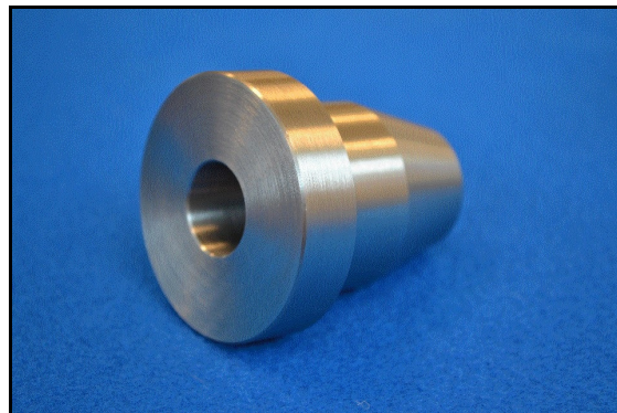
Figure 2. Vapor Pin™ Drilling Guide.