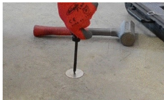
Figure 5. Tightening the Secured Cover.