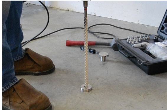
Figure 4. Using the Drilling Guide.