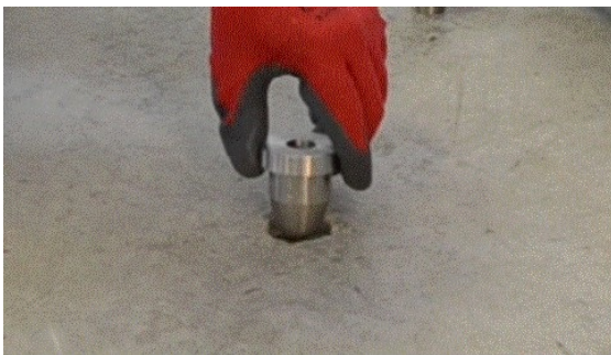
Figure 3. Testing Depth with the Drilling Guide.