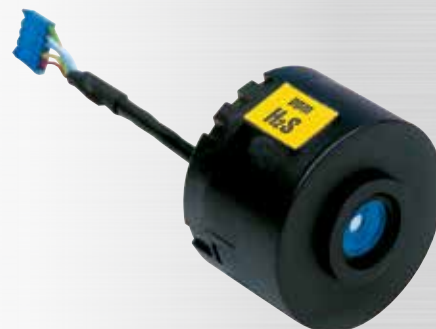
Pre-calibrated sensor for easier maintenance