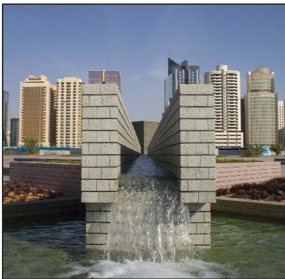
The Abu Dhabi Corniche, United Arab Emirates