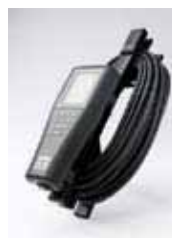
603062 cable management kit.