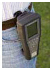
603069 belt clip.

* Special order cable lengths up to 100-meters in 10-meter increments available. ** Standard