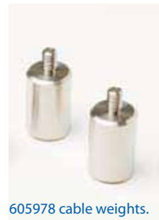
605978 cable weights.

* Special order cable lengths up to 100-meters in 10-meter increments available. ** Standard