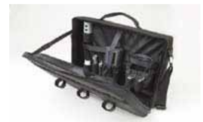
603075 soft-sided carrying case with Pro20, cable, and accessories.

To order, or for more information, contact: