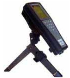
063507 tripod is ideal for lab situations.