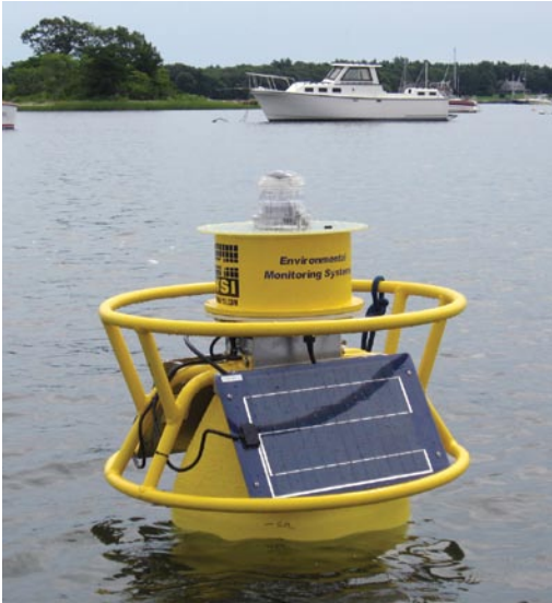
The EMM68 buoy is lightweight and easy to deploy from shore or small boat