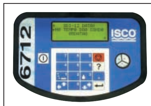
The 6712 Controller is an SDI-12 logger. Manual pump operations are now located on the front panel keys.

Note: Power source, bottle configuration, suction line, and strainer must be ordered separately. Other options and accessories are also available. Contact Isco or your Isco Representative for complete information.