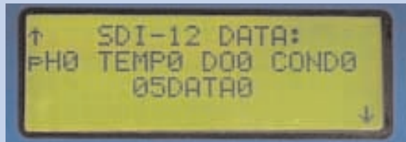
Display window showing SDI-12 connection status.

The 6712 functions as a SDI-12 logger and connects to any sensor that fully implements the protocol standard.