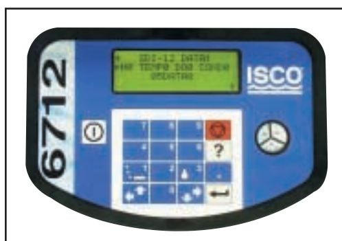
The 6712 Controller is an SDI-12 logger. Manual pump operations are now located on the front panel keys.