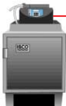
Isco 6712 Sampler